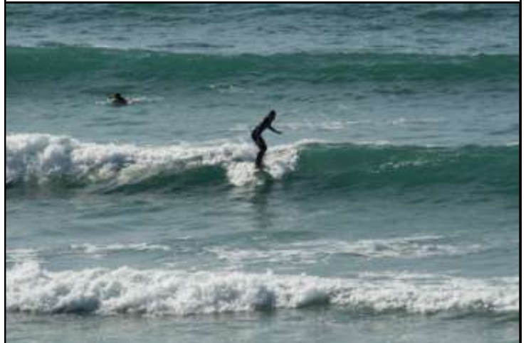
Jannis Rothkegel on surf camp at the end of Term 1