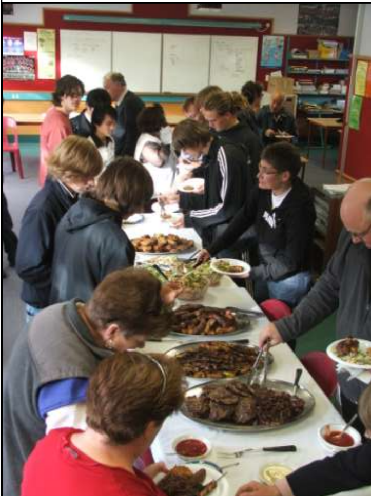
Homestay parents, students and King's High School staff mingle at the barbeque in February.

We do appreciate the time and energy you give to the boys. It is a real strength of the International Programme that we can offer such caring environments.